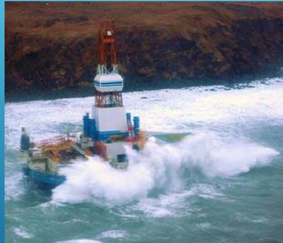
Shell owned Kulluk ran aground in 2012 en-route from the North Slope in the Beaufort Sea to Seattle